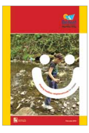
Shaping Healthier Neighbourhoods for Children, February 2012

The report includes a Children's Charter, which is based on the wishes expressed by children and links to existing academic evidence in this field.