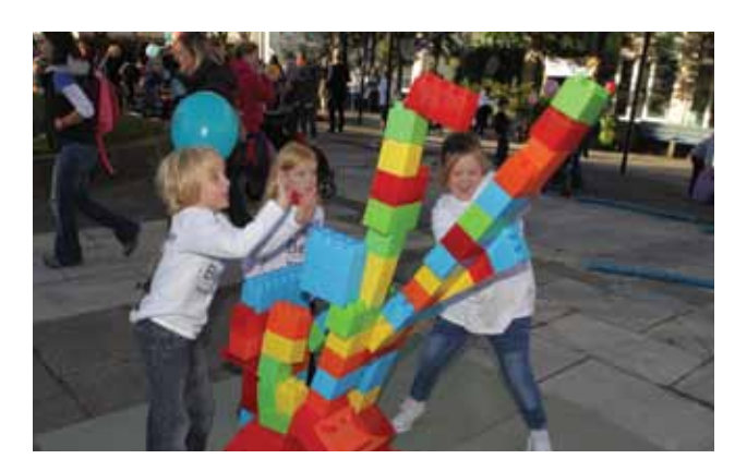
Free space at Culture Night, September 2012

The programme with children in west Belfast, resulted in the launch of 'Shaping healthier neighbourhoods for children', in City Hall on 28 February. It involved 100 children from three primary schools St. John the Baptist,