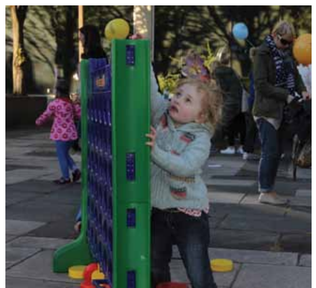
Games at Culture Night, September 2012